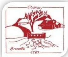
Potton Heritage Association