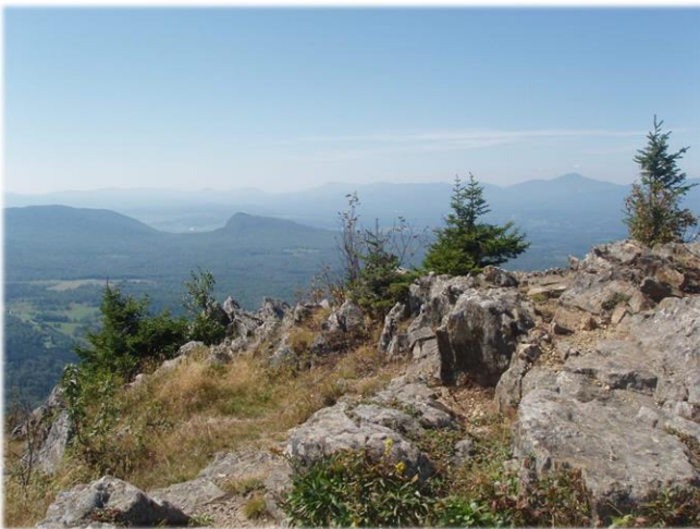
Vue du sommet d'Owl's Head, en direction sud-ouest View from Owl's Head towards the south-west