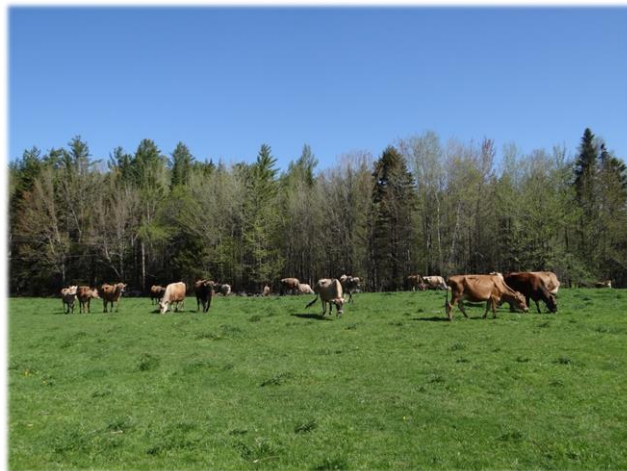
Les vaches laitières de Wayne Bedard – chemin West Hill Wayne Bedard's milk cows – chemin West Hill