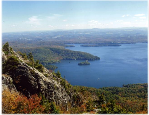
Vue du sommet d'Owl's Head, en direction est View from the summit of Owl's Head towards the east