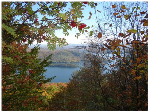
Vue sur le lac Memphrémagog, du sentier Panorama View onto Lake Memphremagog from Panorama trail