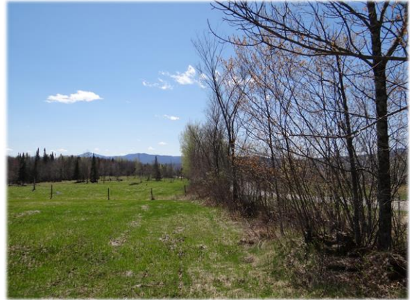
Bande de friche le long du chemin Peabody Brush strip on chemin Peabody