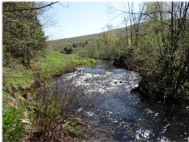
Le ruisseau Ruiter Ruiter Brook Creek