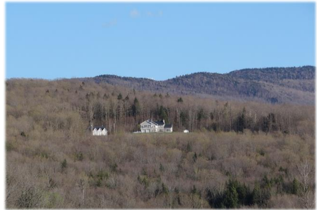
Implantation mal intégrée Poor siting in a natural environment