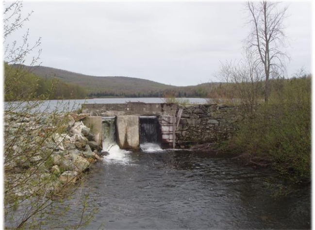
Barrage de l'étang Fullerton Fullerton Pond Dam