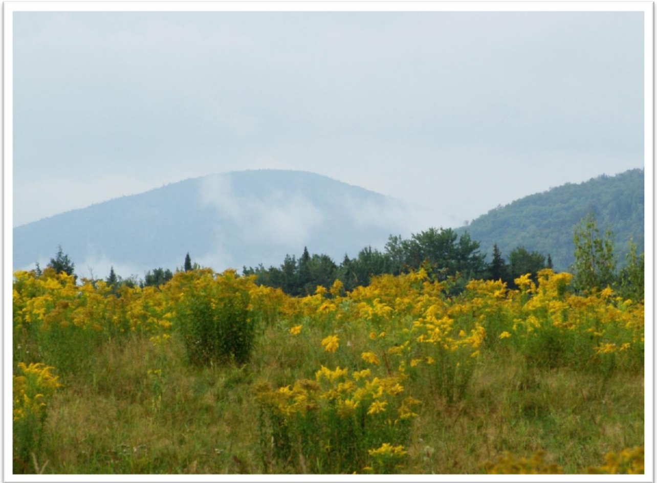
Prairie de verges d'or Goldenrod meadow