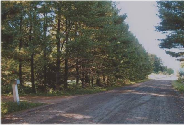
Écran obstructif Inappropriate screen