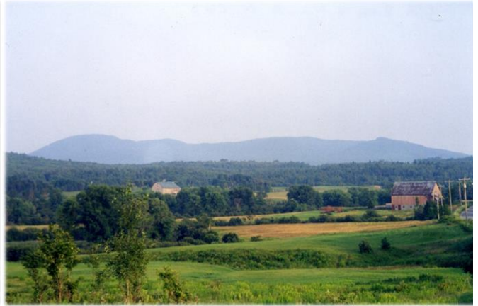
Vue sur la vallée et le mont Bear, de la route 243 View from Highway 243 across the valley towards Mt. Bear