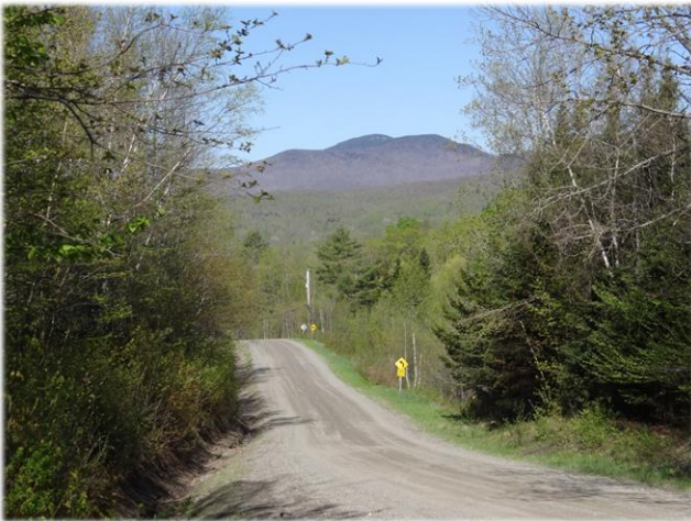
Le sommet Rond des monts Sutton, du chemin West Hill Round Top from chemin West Hill