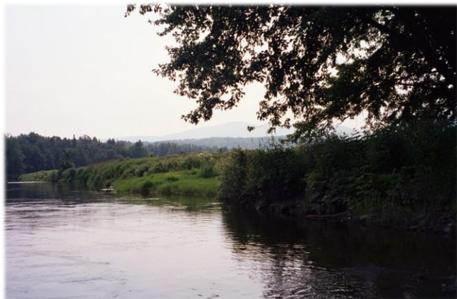
La rivière Missisquoi Missisquoi River