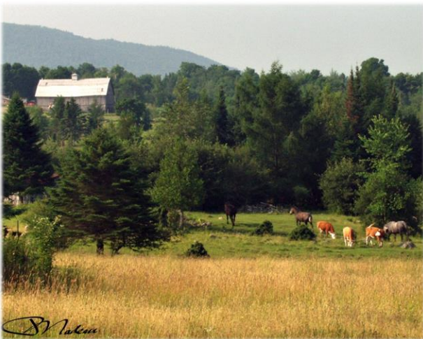
Vue en direction sud-ouest, du chemin Laliberté View towards the south-west from chemin Laliberté