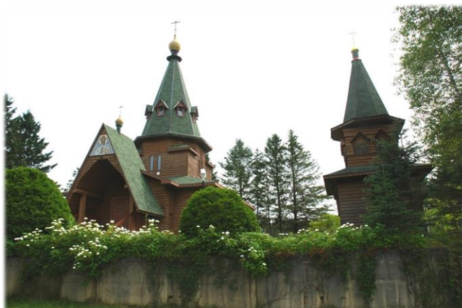
Le monastère russe The Russian Monastery