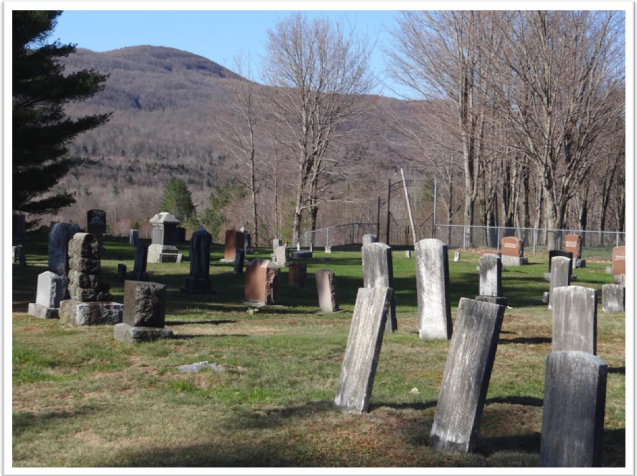
Cimetière Ruiters Settlement, à Dunkin Ruiters Settlement Cemetery at Dunkin