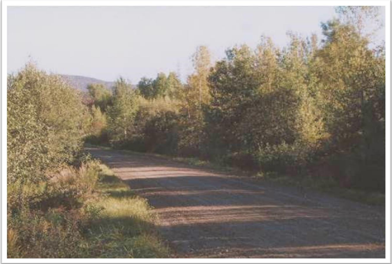
Friche sur le chemin Ruitter Brook Brush along chemin Ruitter Brook