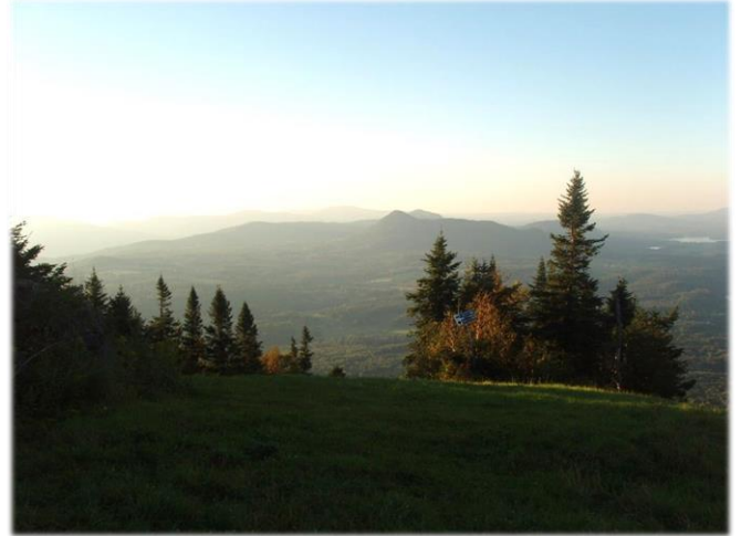
Vue en direction nord, du mont Owl's Head View from Owl's Head towards the north