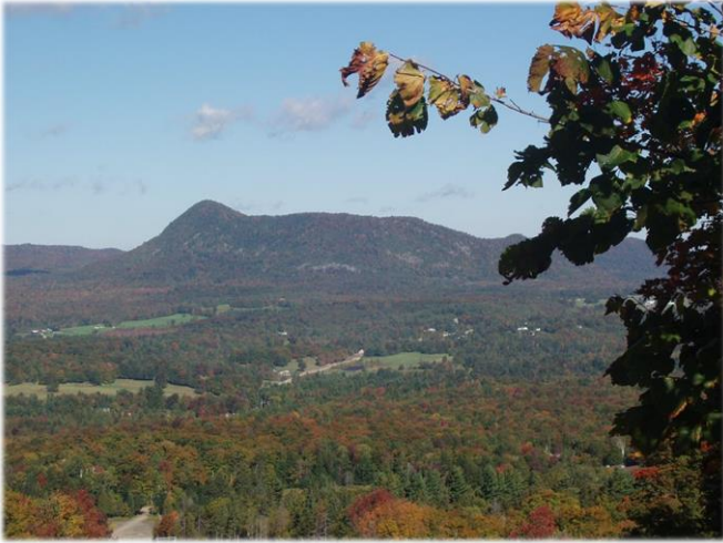
Le mont Éléphant, vu du sommet d'Owl's Head View from Owl's Head onto Mt. Elephantis