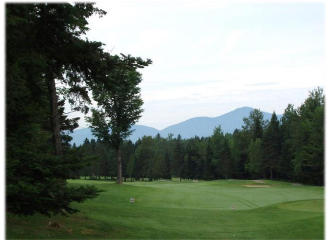
Vue du terrain de golf Owl's Head et de Jay Peak View from Owl's Head golf course towards Jay Peak