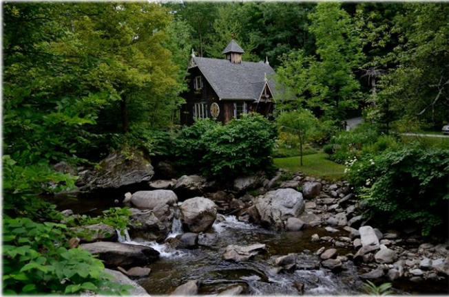
Maison du peintre Craig Skinner, à Dunkin Painter Craig Skinner's house at Dunkin