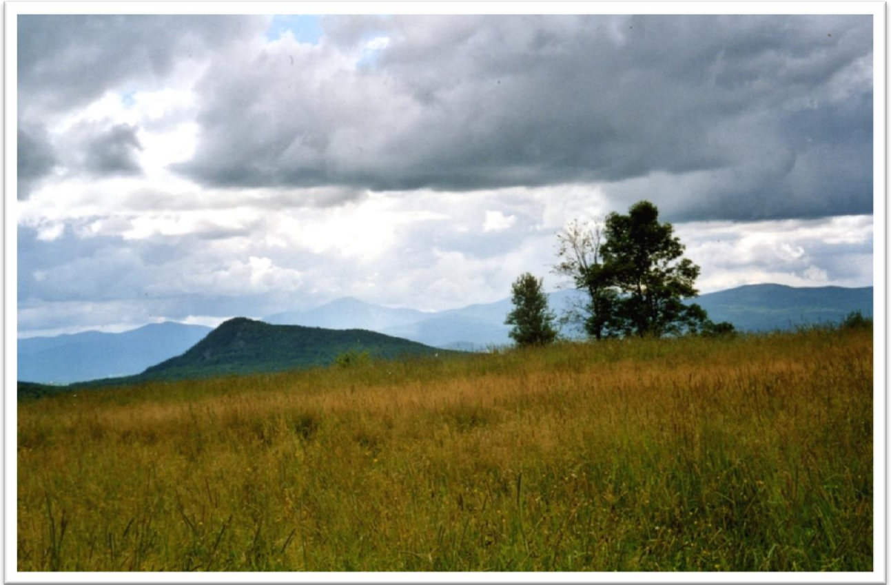
Vue sur le mont Hawk et les Appalaches, du chemin Hill Top View from chemin Hill Top onto Mt. Hawk and the Appalachian Mountains