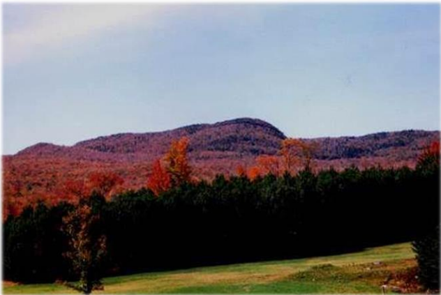
Plantation de conifères discordante Unharmonious pine plantation