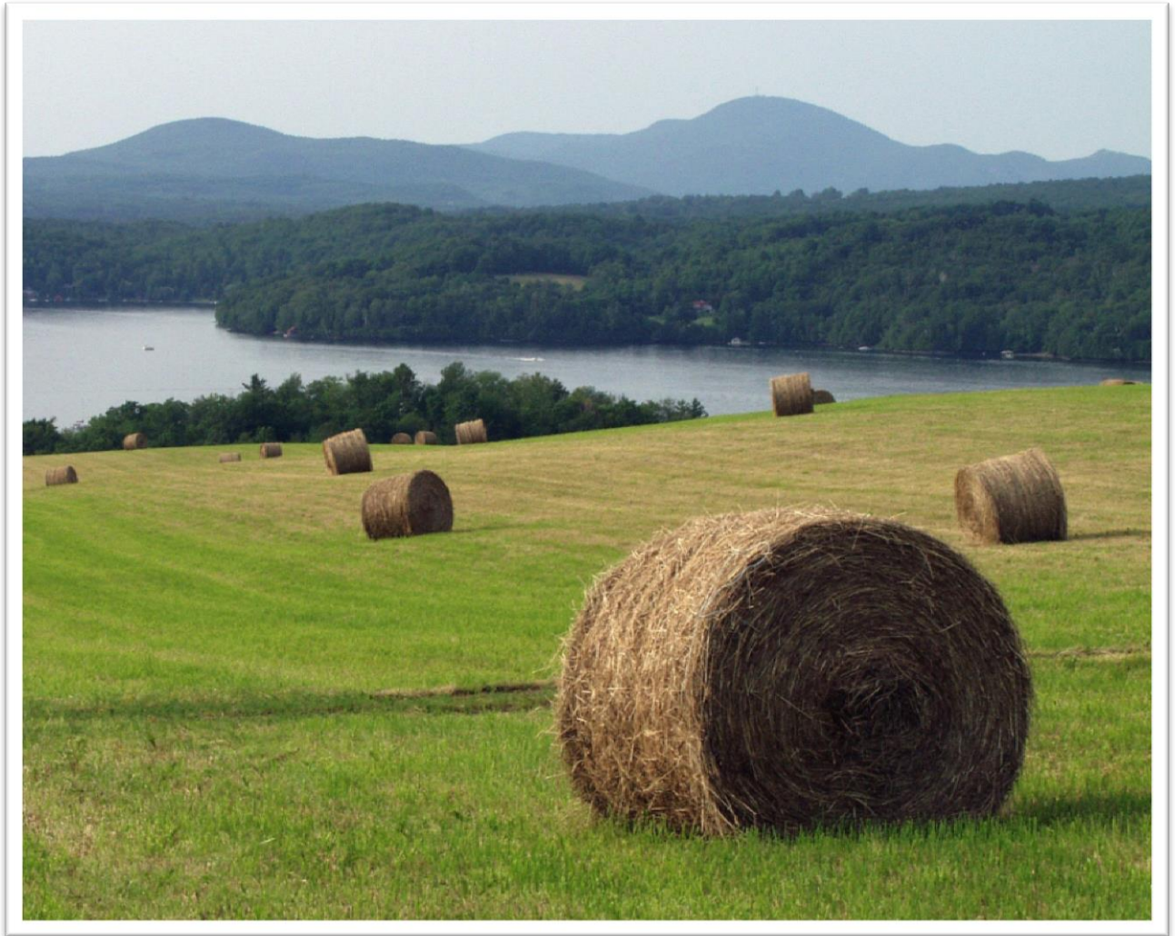
La baie Sargent, vue du chemin du Lac View from chemin du Lac onto Sargent Bay