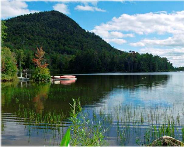
L'étang Sugar Loaf Sugar Loaf Pond