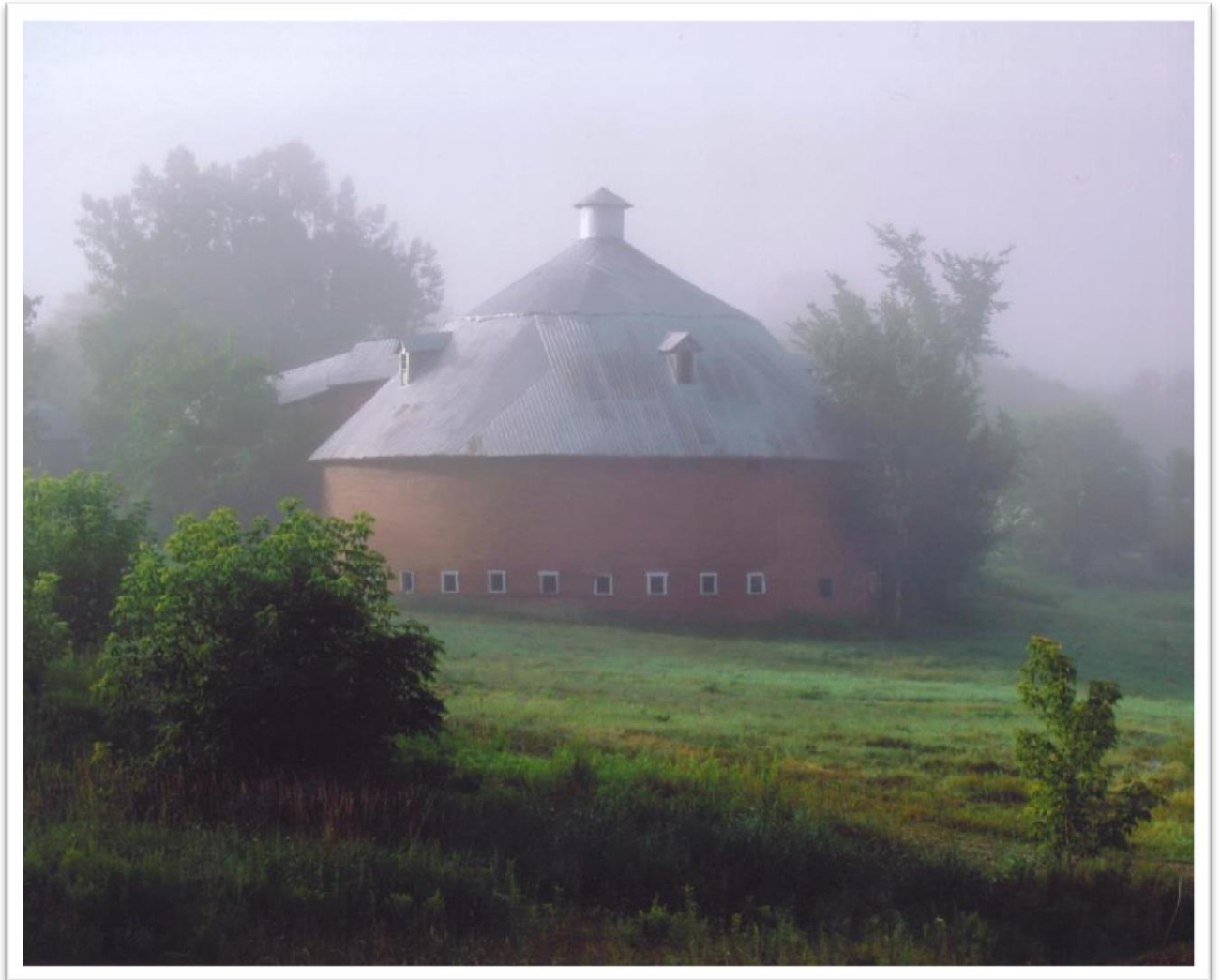
La grange ronde de Mansonville The Round Barn in Mansonville