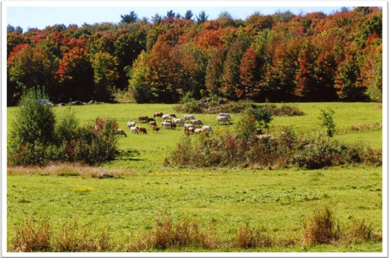
Scène champêtre sur le chemin de Vale Perkins Rural setting on chemin Vale Perkins