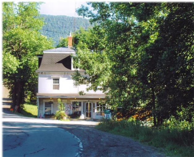
Le magasin Jewett, à Vale Perkins The Jewett Store in Vale Perkins