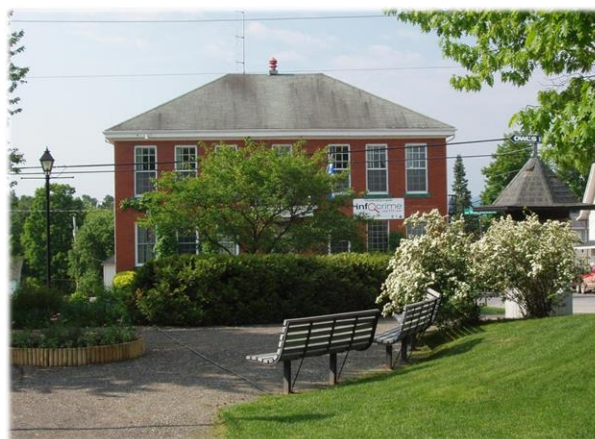
L'hôtel de ville du Canton de Potton The Town Hall of Potton Township