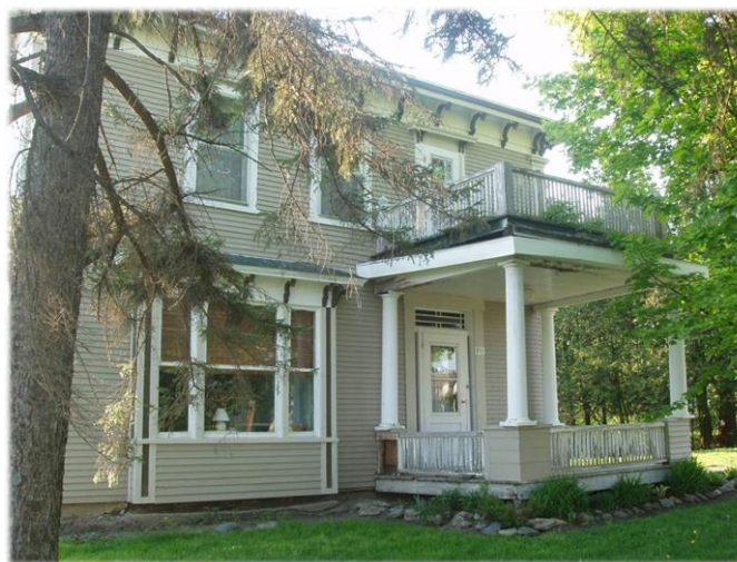
Maison patrimoniale au 283, rue Principale Heritage building, 283 rue Principale