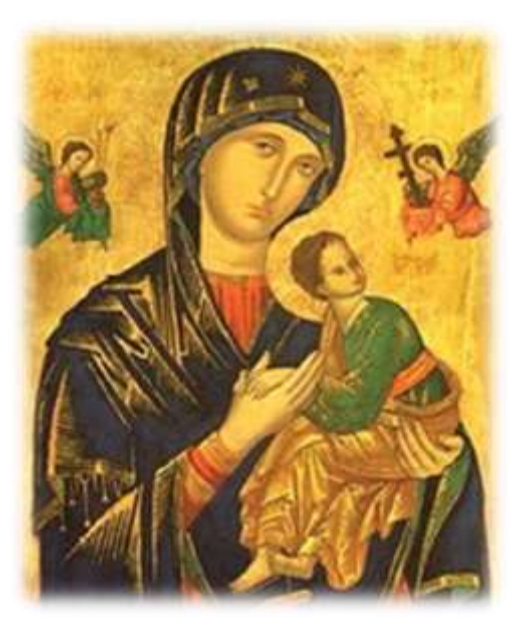
Icône de la Vierge du Perpétuel Secours

Potton has a richly diverse religious heritage of which Vorokhta's St. John the Baptist Chapel is a magnificent example.