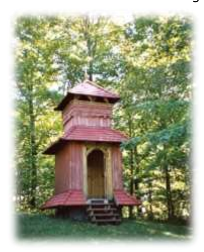
The bell tower

In 1985, to mark the millennium of the Ukrainian Church in Kiev, the people of Vorokhta decided to enlarge their chapel in the architectural