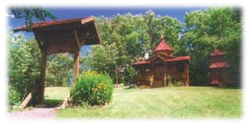
The St. John the Baptist Ukrainian Chapel 1985