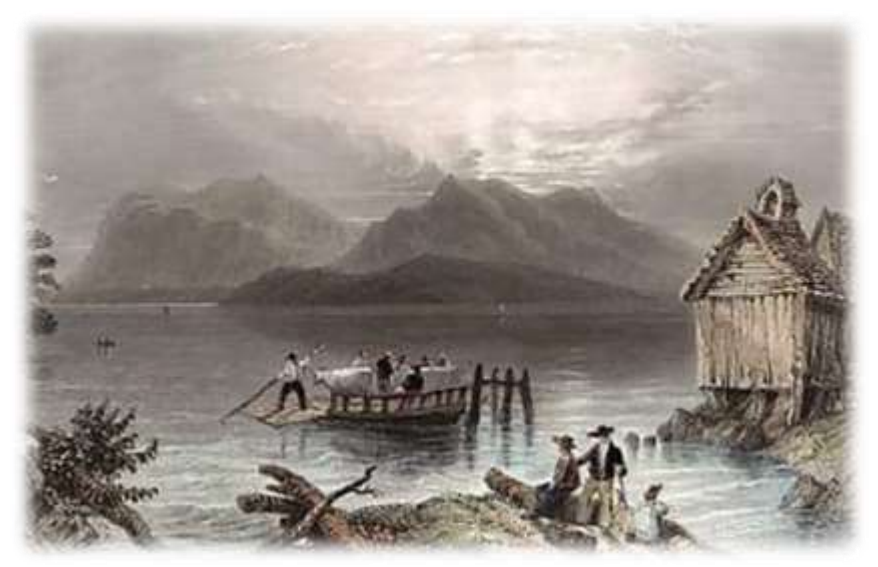
W.H. Bartlett, Copp's Ferry, 1841